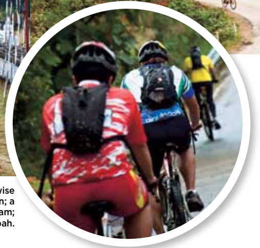
TWISTS AND TURNS Clockwise from above: Biking in Bhutan; a winding trail in north Vietnam; heading uphill in Sabah.